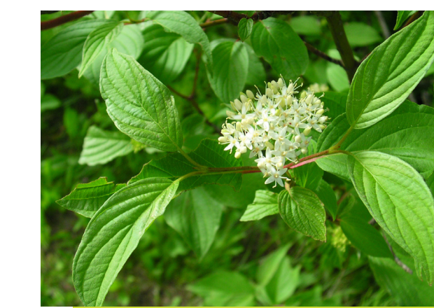
▲ Red osier dogwood ▼ Interior willow ▶ Staghorn sumac