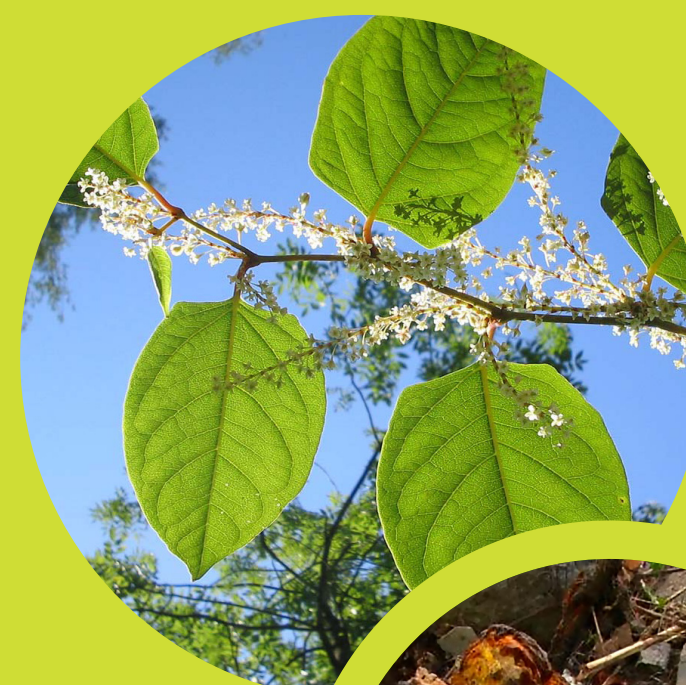
▲ Leaves ▶ Roots

Be careful, Japanese knotweed can be confused with giant knotweed and/or Bohemian knotweed.