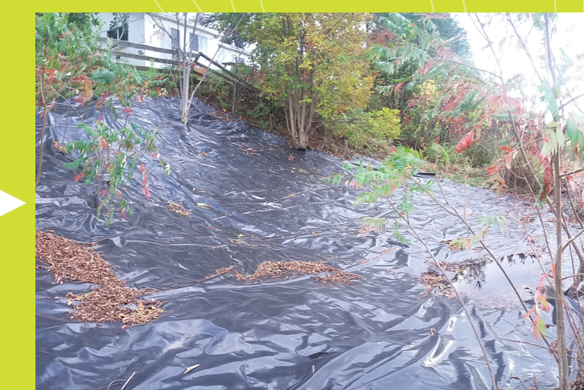
▲ Installed geomembrane