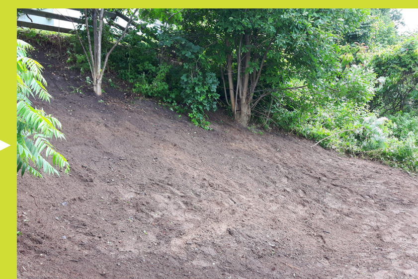
▲ After cutting