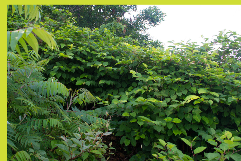
▲ Initial colony

There are other methods to control Japanese knotweed. For more information, please visit the Comité ZIP des Seigneuries website.