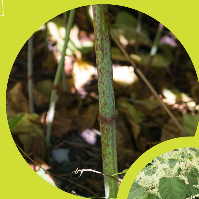
▲ Stem ▶ Flowers